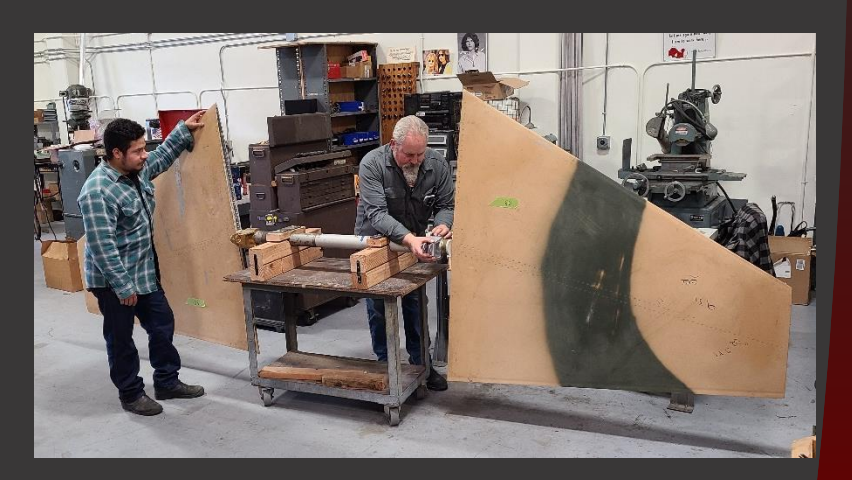
F-5 Horizontal Stabilizers Overhaul/Repair

(Leased previously to Chilean and Moroccan AF)