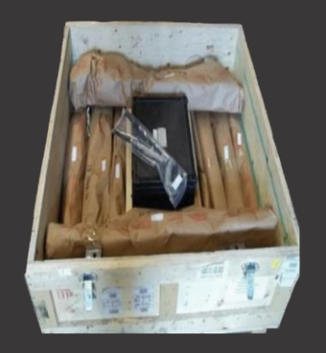
RK1005 A/B Kit

(Leased previously to Chilean and Moroccan AF)